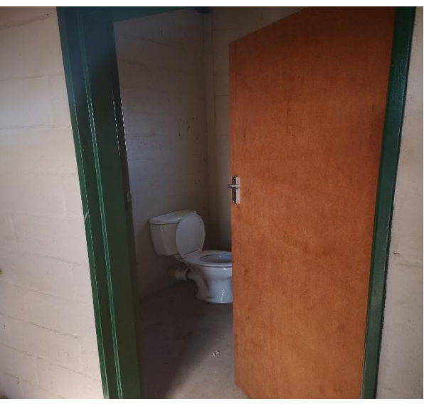
Adequate ablution facilities for shearers