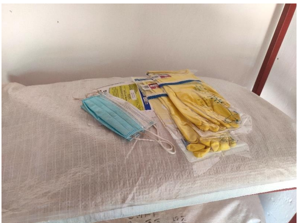
PPE according to OHSA legislation