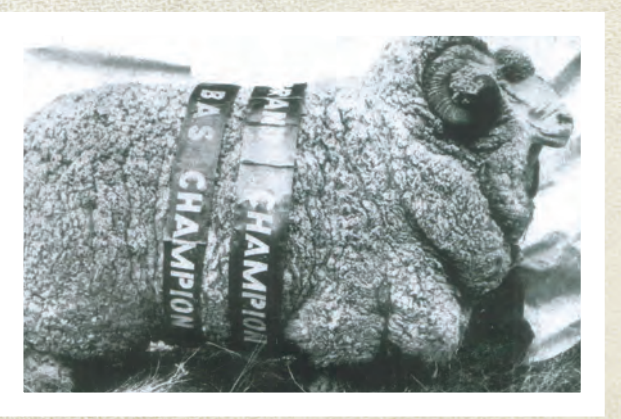
"Handsome", the Grand Champion Ram of the Border Agricultural Show, Queenstown, 1946. Grey Craig merino sheep were known as "South Africa's royal flock".

Sheep shearing on Grey Craig was always one of the main tasks on the farming calendar. On completion, Ken's wool bales were loaded onto a wagon drawn by oxen and carted to the nearby station. The wagon, with its heavy load, left wheel indentations on the tar road, which could be seen for many years after, reminding one of the 'good old days'.